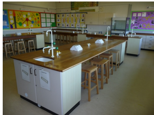
Science Laboratory (2)