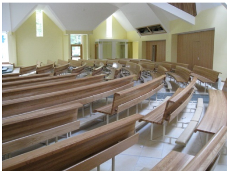
Church Seating (4)