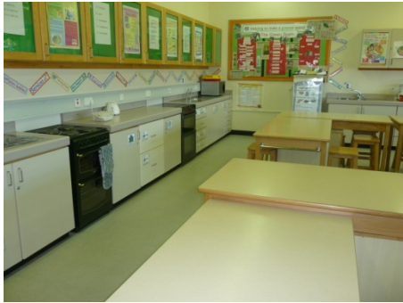
Home Economics Room