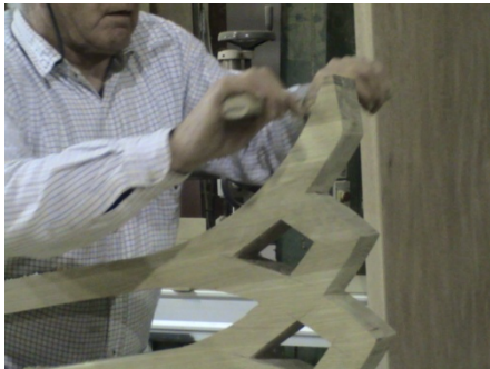
Hand Finishing (2)