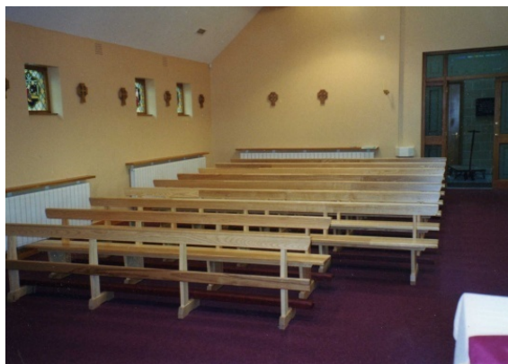
Church Seating (1)