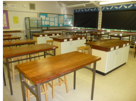
Science Laboratory (3)