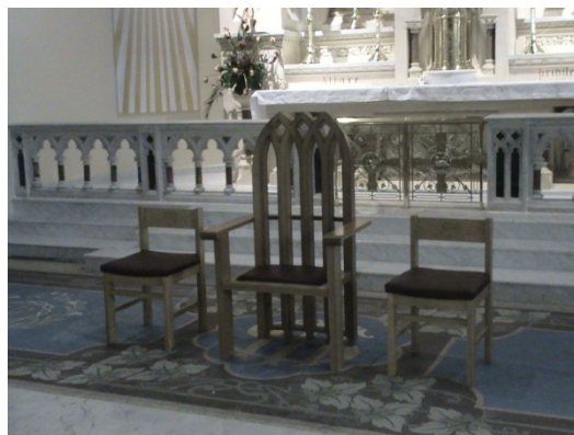
Finished Chair (2)