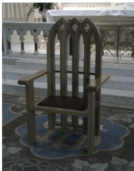
Finished Chair (1)