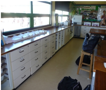
Science Laboratory (1)