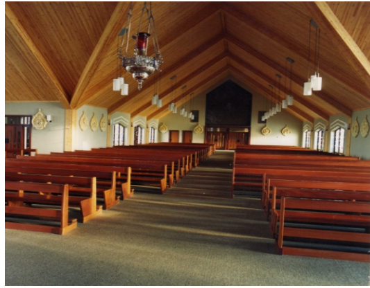
Church Seating (2)