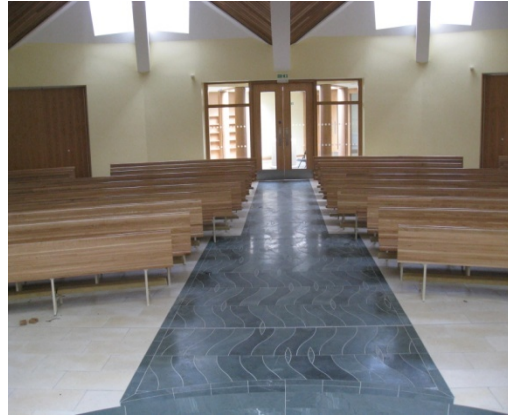
Church Seating (3)