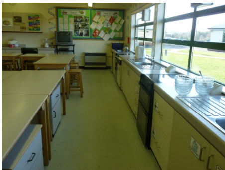
Home Economics Room (2)