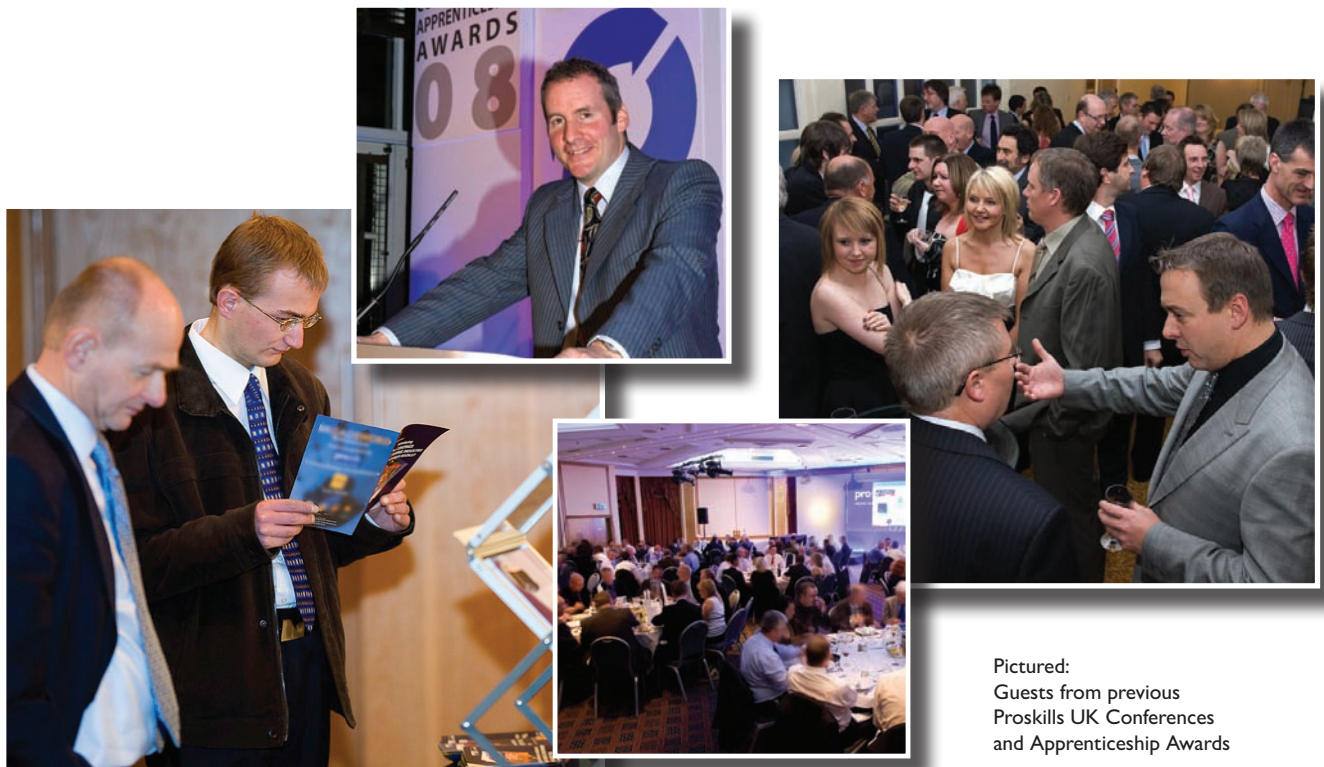
Pictured: Guests from previous Proskills UK Conferences and Apprenticeship Awards